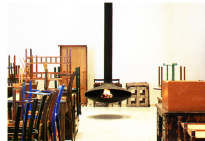
Installation view of Geoffrey Farmer's A Pale Fire 2005

FARMER ENGAGES THE GALLERY'S FUNCTION AS A PUBLIC COMMUNICATOR